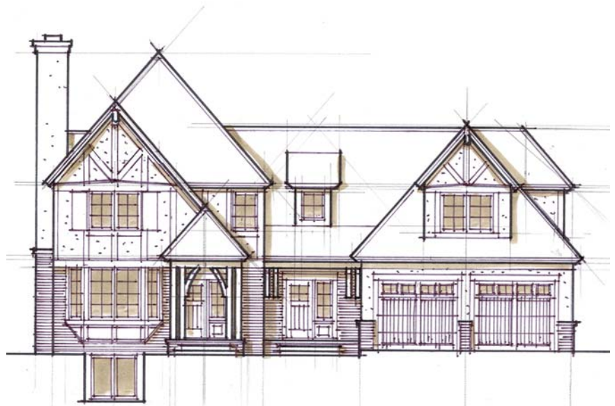
FRONT ELEVATION 1/8" = 1'-0"

201- BALCONY 202- BEDROOM #1 203- BATH 204- BEDROOM #2 205- MASTER BEDROOM 206- LAUNDRY 207- MASTER BATH 208- MASTER HALL 209- MASTER CLOSET 210- STAIR LANDING 211- BONUS ROOM 212- STORAGE