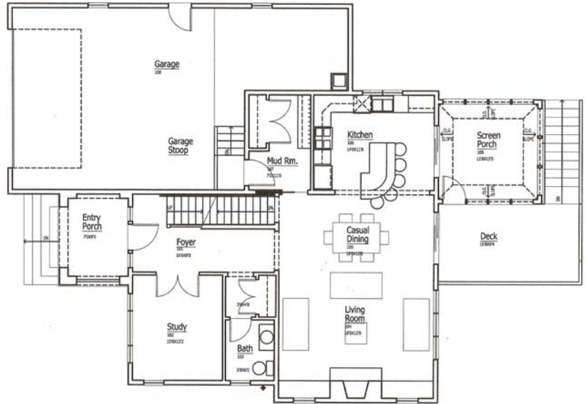
First Floor Plan: 1,106 S.F.